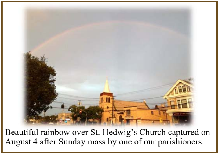
Beautiful rainbow over St. Hedwig's Church captured on August 4 after Sunday mass by one of our parishioners.