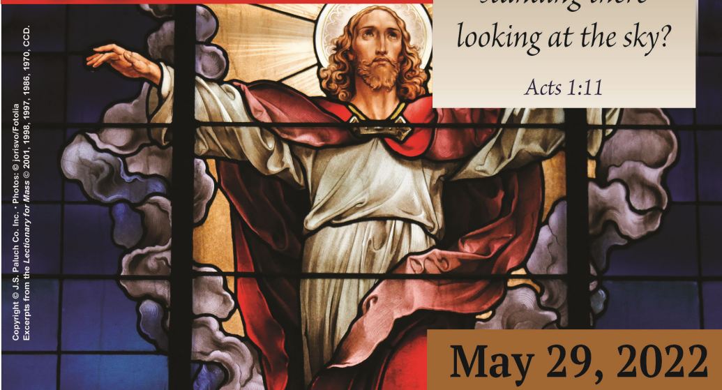
Copyright © J.S. Faluch Co., Inc. Excerpts from the Lectioary for Mass © 2001, 1998, 1997, 1986, 1970, CCD.