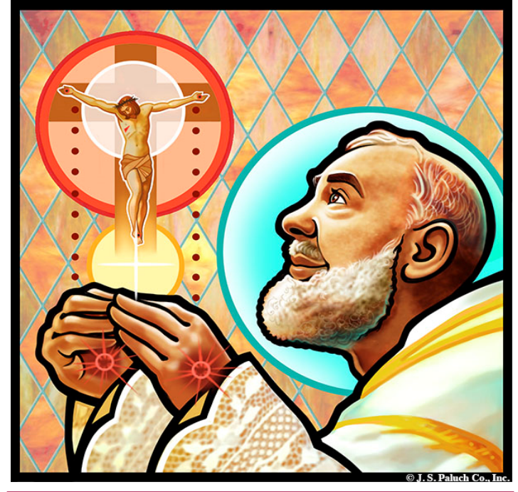
St. Pio Pray for Us