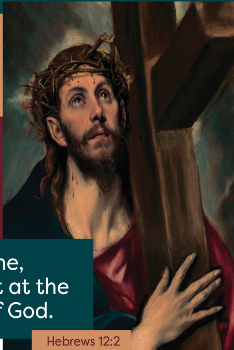
Copyright © J.S. Paluch Co., Inc. - Photos: © PD-Wikimedia, Christ Carrying the Cross by El Greco Excerpted from the Lectorian for Mass © 2001, 1998, 1997, 1886, 1870, CCB.